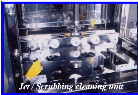
Jet / Scrubbing cleaning unit